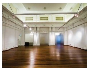
Gallery II $1,140 / 4hrs $600 / day ‡*