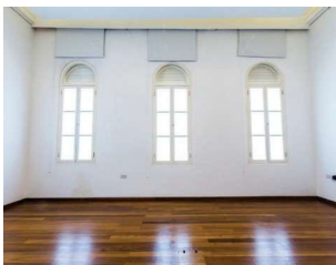
Council Room $100 / hr