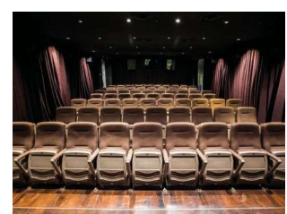
Screening Room $480 / 4hrs $150 / 2hrs (Film screenings only)