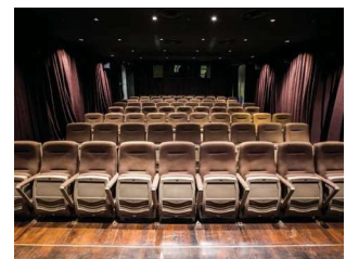
Screening Room $240 / 4hrs $150 / 2hrs (Film screenings only)

† Note: F&B is not allowed at this venue