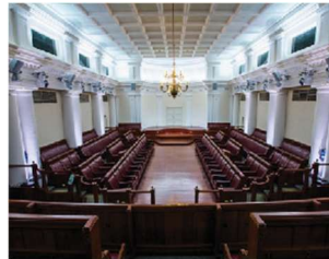
Chamber † $750 / 4hrs