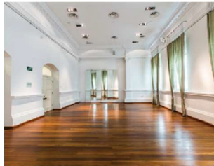
Living Room $450 / 4hrs $300 / day ‡*