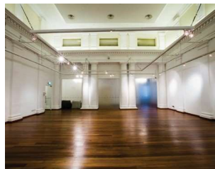
Gallery II $570 / 4hrs $300 / day ‡*