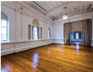
Blue Room $600 / 4hrs $300 / day ‡*

Rental is by 4-hour blocks, unless otherwise indicated. Setup/teardown rates thereafter at 60% of published rate.