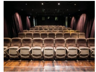
Screening Room $640 / 4hrs $150 / 2hrs (Film screenings only)