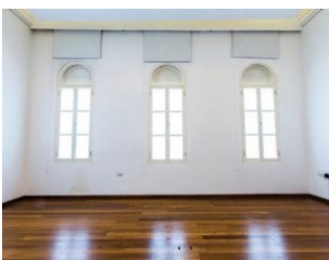
Council Room $100 / hr