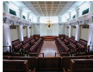
Chamber † $2,000 / 4hrs