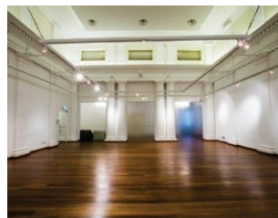
Gallery II $1,520 / 4hrs $800 / day ‡*